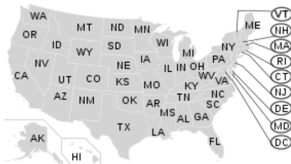
Map of the United States with each state and the District of Columbia labelled with the second part of its ISO 3166-2 code.